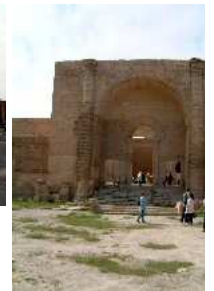
Colonnaded temple at Hatra © ER 2001.