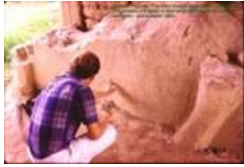
Sennacherib's palace on Kuyunjik.