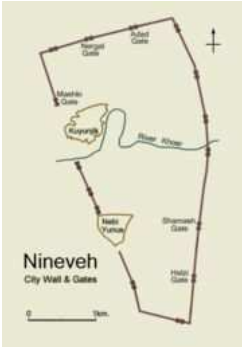
Simplified plan of ancient Nineveh showing city wall and location of gateways.