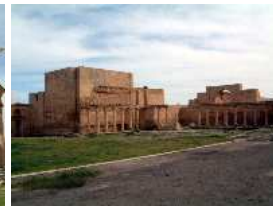
Colonnades at Hatra.