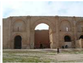
Parthian-style temple facade at Hatra.