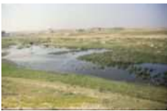
Eastern city wall & Shamash Gate.