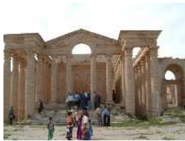
Greek-style temple facade at Hatra.