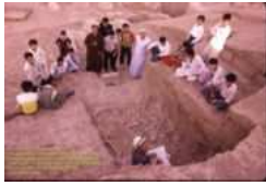
Halzi Gate excavation.