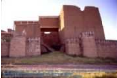
Adad Gate. Reconstructed