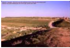
Kuyunjik from the North.