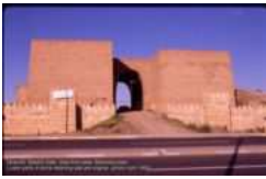
Mashki Gate. Reconstructed.