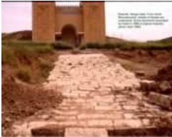
Nergal Gate. Reconstructed.