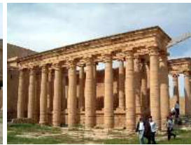
Parthian-style temple entrance at Hatra.